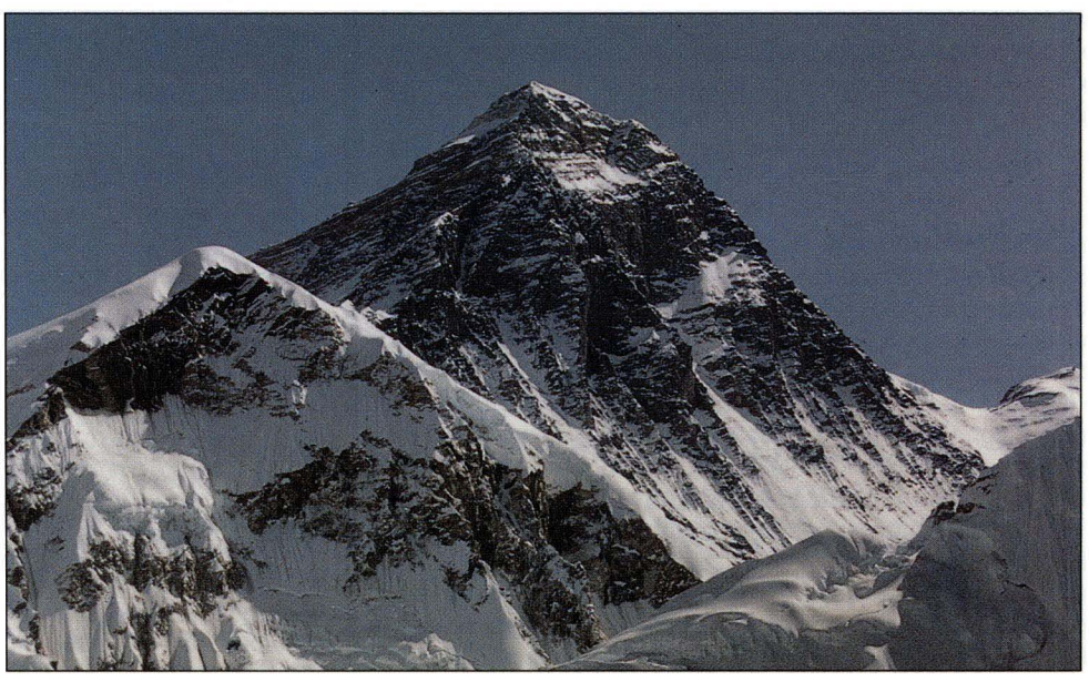
View of Mt Everest (8848 m) from Mt Kalapatar

The expedition started from Kathmandu at the beginning of March and after some pleasant trekking via the Sagarmatha National Park, base camp was established on March 25th near the Khumbu Icefall